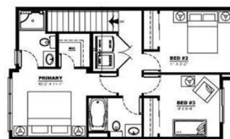
UPPER FLOOR PLAN = 653 SQ FT