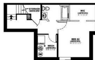
LOWER FLOOR PLAN = 474 SQ FT