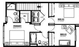
UPPER FLOOR PLAN = 653 SQ FT